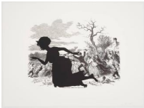
Alabama Loyalists Greeting the Federal Gun- Boats, from "Harper's Pictorial History of the Civil War (Annotated)"

Offset lithography and silkscreen on Somerset Textured paper