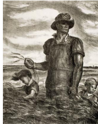
Our Good Earth