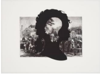
Exodus of Confederates from Atlanta, from "Harper's Pictorial History of the Civil War (Annotated)"