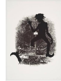
Scene of McPherson's Death, from "Harper's Pictorial History of the Civil War (Annotated)"

Offset lithography and silkscreen on Somerset Textured paper