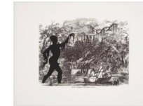
Cotton Hoards in Southern Swamp, from "Harper's Pictorial History of the Civil War (Annotated)"

Offset lithography and silkscreen on Somerset Textured paper