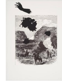
Buzzard's Roost Pass, from "Harper's Pictorial History of the Civil War (Annotated)"

Offset lithography and silkscreen on Somerset Textured paper