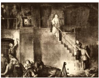
Murder of Edith Cavell