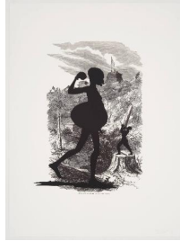
Signal Station, Summit of Maryland Heights, from "Harper's Pictorial History of the Civil War (Annotated)"

Offset lithography and silkscreen on Somerset Textured paper