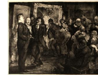
Artists Judging Works of Art, second state