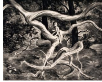
[Girl in Tree]

1922-1995 Lawrence Beall Smith Lithograph