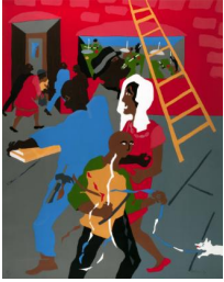
On the Way