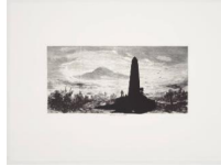
Lost Mountain at Sunrise, from "Harper's Pictorial History of the Civil War (Annotated)"

Offset lithography and silkscreen on Somerset Textured paper