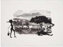
An Army Train, from "Harper's Pictorial History of the Civil War (Annotated)"