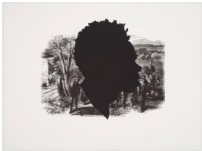
Confederate Prisoners Being Conducted from Jonesborough to Atlanta, from "Harper's Pictorial History of the Civil War (Annotated)"

Offset lithography and silkscreen on Somerset Textured paper