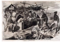
Thanksgiving in Camp (For Harper's Weekly, November 29, 1862, p. 764)