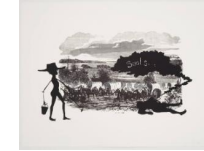
An Army Train, from "Harper's Pictorial History of the Civil War (Annotated)"