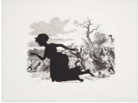
Alabama Loyalists Greeting the Federal Gun- Boats, from "Harper's Pictorial History of the Civil War (Annotated)"