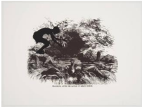
Deadbrook after the Battle of Ezra's Church, from "Harper's Pictorial History of the Civil War (Annotated)"

Offset lithography and silkscreen on Somerset Textured paper