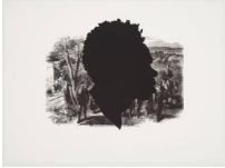
Confederate Prisoners Being Conducted from Jonesborough to Atlanta, from "Harper's Pictorial History of the Civil War (Annotated)"