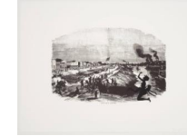
Occupation of Alexandria, from "Harper's Pictorial History of the Civil War (Annotated)"

Offset lithography and silkscreen on Somerset Textured paper