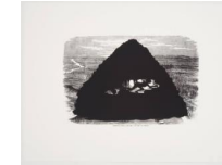
Foote's Gun-Boats Ascending to Attack Fort Henry, from "Harper's Pictorial History of the Civil War (Annotated)"

Offset lithography and silkscreen on Somerset Textured paper