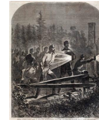
Rebels Outside their Works at Yorktown Reconnoitring [sic] with Dark Lanterns (For Harper's Weekly, May 17, 1862, p. 305)

Offset lithography and silkscreen on Somerset Textured paper