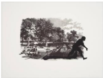
Banks's Army Leaving Simmsport, from "Harper's Pictorial History of the Civil War (Annotated)"

Offset lithography and silkscreen on Somerset Textured paper