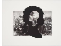
Exodus of Confederates from Atlanta, from "Harper's Pictorial History of the Civil War (Annotated)"

Offset lithography and silkscreen on Somerset Textured paper