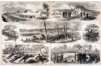
Our Army Before Yorktown, Virginia (For Harper's Weekly, May 3, 1862, pp. 280–281)