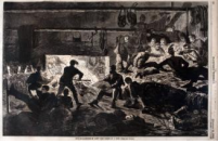
Winter Quarters in Camp - The Inside of a Hut (Harper's Weekly, January 24, 1863, p.52)