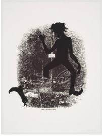
Scene of McPherson's Death, from "Harper's Pictorial History of the Civil War (Annotated)"