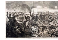
The War for the Union, 1862 - A Cavalry Charge (For Harper's Weekly, July 5, 1862, pp. 424–425)

Offset lithography and silkscreen on Somerset Textured paper