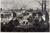
Halt of a Wagon Train (For Harper's Weekly, February 6, 1864)