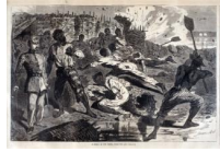
A Shell In The Rebel Trenches (For Harper's Weekly, January 17, 1863, p. 36)