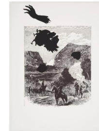
Buzzard's Roost Pass, from "Harper's Pictorial History of the Civil War (Annotated)"

Offset lithography and silkscreen on Somerset Textured paper