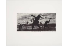
Crest of Pine Mountain, Where General Polk Fell, from "Harper's Pictorial History of the Civil War (Annotated)"

Offset lithography and silkscreen on Somerset Textured paper