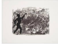
Cotton Hoards in Southern Swamp, from "Harper's Pictorial History of the Civil War (Annotated)"

Offset lithography and silkscreen on Somerset Textured paper