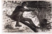
The Army of the Potomac - A Sharp-Shooter on Picket Duty (For Harper's Weekly, November 15, 1862, p. 724)

Offset lithography and silkscreen on Somerset Textured paper