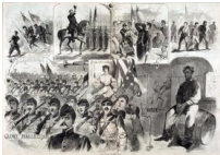
The Songs of the War (For Harper's Weekly, November 23, 1861, pp. 744–745)

Offset lithography and silkscreen on Somerset Textured paper