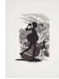
Signal Station, Summit of Maryland Heights, from "Harper's Pictorial History of the Civil War (Annotated)"