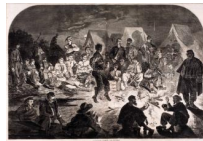
A Bivouac Fire on the Potomac (For Harper's Weekly, December 21, 1861, pp. 808-809)