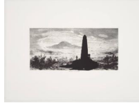
Lost Mountain at Sunrise, from "Harper's Pictorial History of the Civil War (Annotated)"